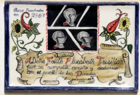
wall plaque, Casa Uno